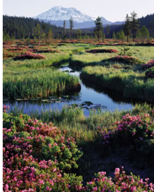
Mountains, streams and lakes are common sights along the Cascade Lakes National Scenic Byway.

Have an idea for an article? Please send your 1,000 word (or less) article and photos to info@nsbfoundation.com .