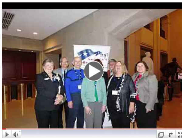
Foundation Directors attending December 6th event