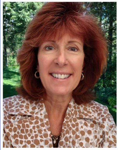
Leslie McLellan Tourism Currents