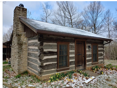
NSBF office Log Cabin

The National Voice of Scenic Byways & Roads